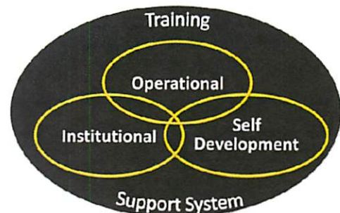
WAYS: Training Domains and the Training Support System

Ends. The training strategy achieves strategic ends through three domains as described in ADP 7-0: institutional, operational, and self-development. Each of these domains is enabled through the TSS that comprises enterprise-wide training products, services, and facilities. The ways and means to achieve the Army Training Strategy vision and strategic ends are described below.